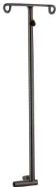
IV POLE WMN2058